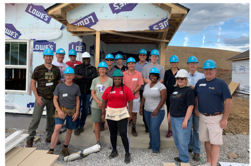
Service Above Self