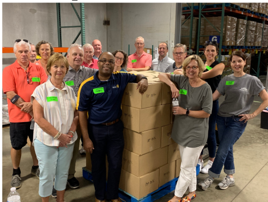
Service Above Self